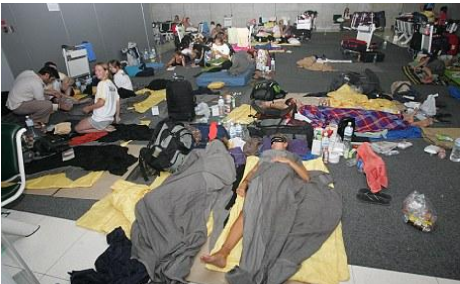
Stranded: Hundreds of desperate Britons sleep on the basement floor at Bangkok's International Airport, Thailand waiting to get flights home

Estimates put the number of Britons still stuck abroad at 35,000.